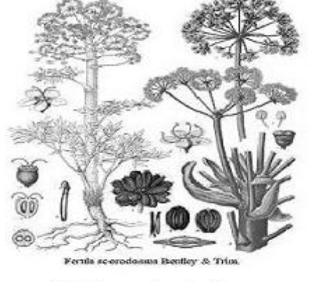
Fig 1 Images of asafoetida